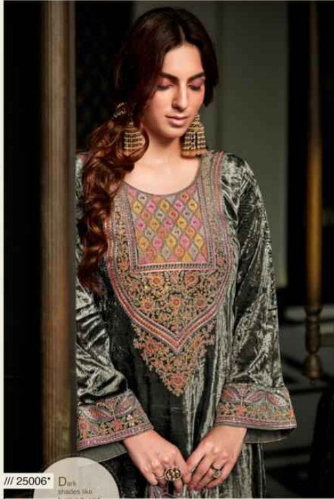
/// 25006* Dyes shades like burgundy and emerald are popular for velvet dresses.