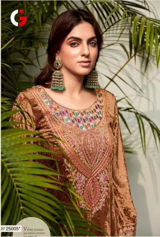
/// 25005* Velvet dresses are often chosen for special occasions like weddings and galas.