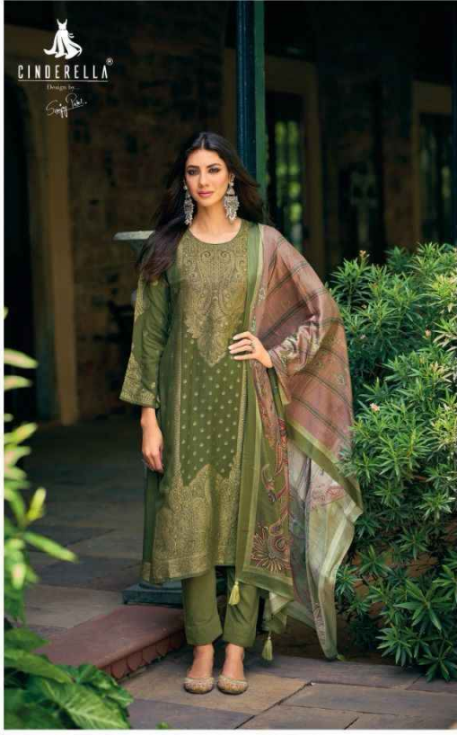
10454 || Remind yourself