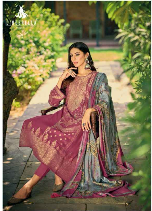
10452 || Remind yourself