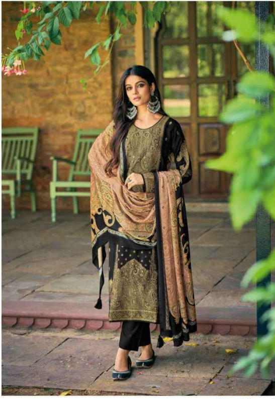
10450 || Remind yourself