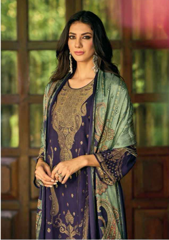
10449 || Remind yourself