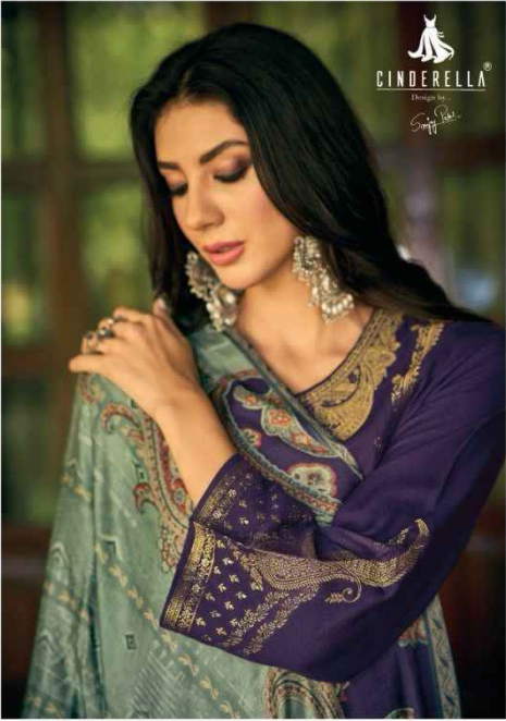
10449 || Remind yourself