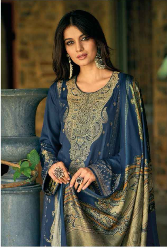
10451 || Remind yourself