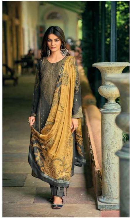
10453 | Remind yourself