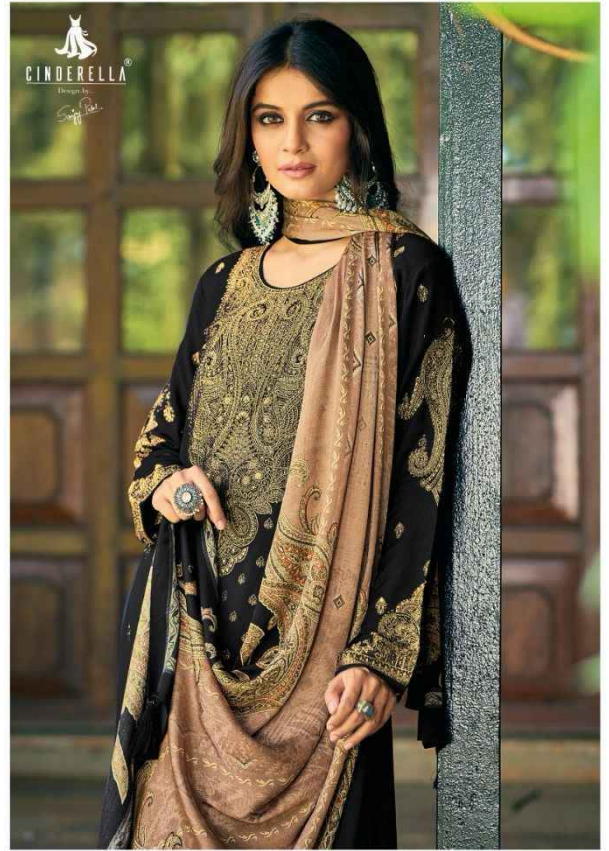
10450 || Remind yourself