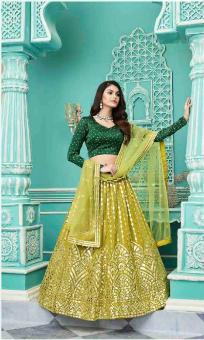
Regain a subtle understated elegance as your signature style.