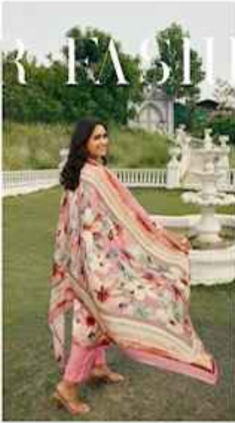
The colors and print of this sari are perfect for the festive season. It is a beautiful choice for a special occasion.