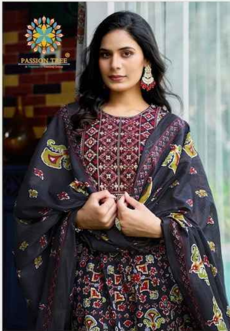
© Passion Tree. All rights reserved. Passion Tree is a registered trademark of Passion Tree. All other trademarks are the property of their respective owners. Passion Tree is not responsible for any damage or loss of data or information. Passion Tree is not responsible for any damage or loss of data or information. Passion Tree is not responsible for any damage or loss of data or information.