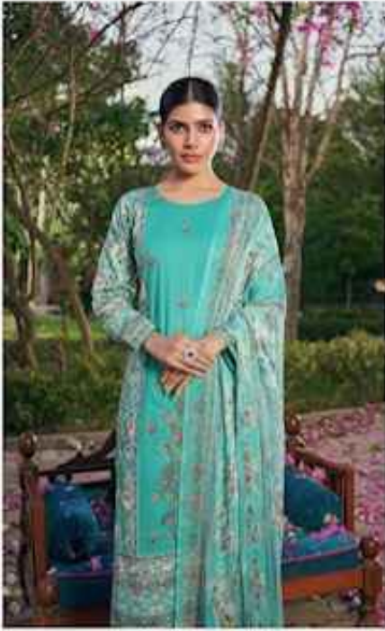
TRADITIONAL SALWAR KAMIZ