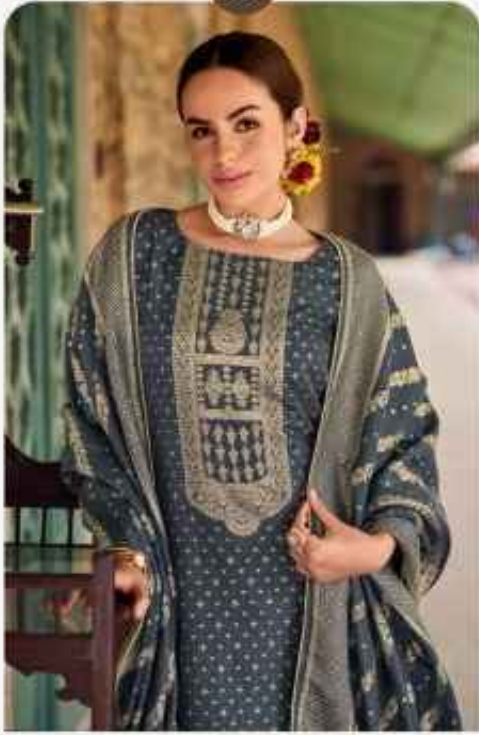
Inspired by history, designed for now. A modern silhouette with an ethnic soul. Fabric that flows like a river's song. To every heart, the heart that sings.