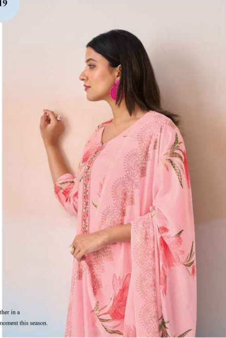
Different cultures come together in a tribute to fashion's biggest moment this season.