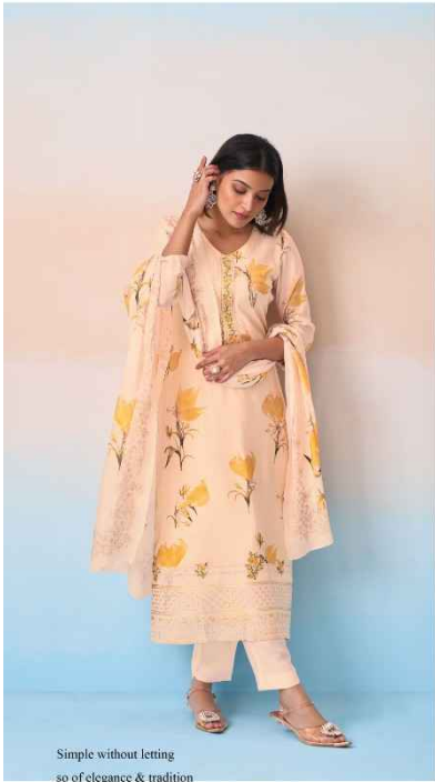
Simple without letting so of elegance & tradition with natural fabrics