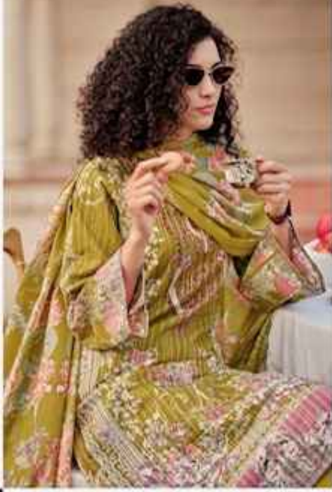
The Spirit of India, Inspired in Thangka Code # 1000001