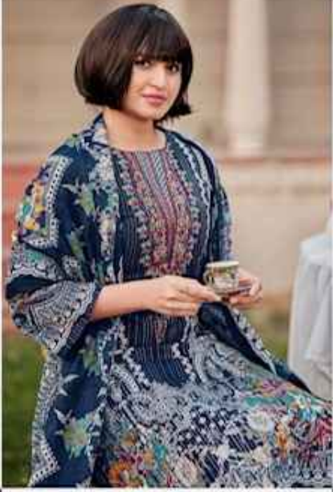
Thousands of Blessings: Kitted for You Code # 1886001