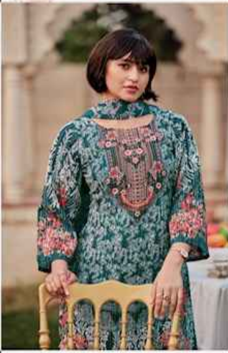
Get Your Saree Tall & Floral Teal Code # 1000008