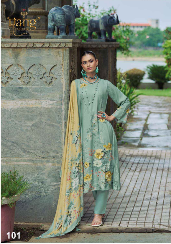
What you wear is how you present yourself to the world, especially today, when human contacts are so quick. Fashion is instant language