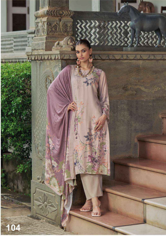
What you wear is how you present yourself to the world, especially today, when human contacts are so quick. Fashion is instant language