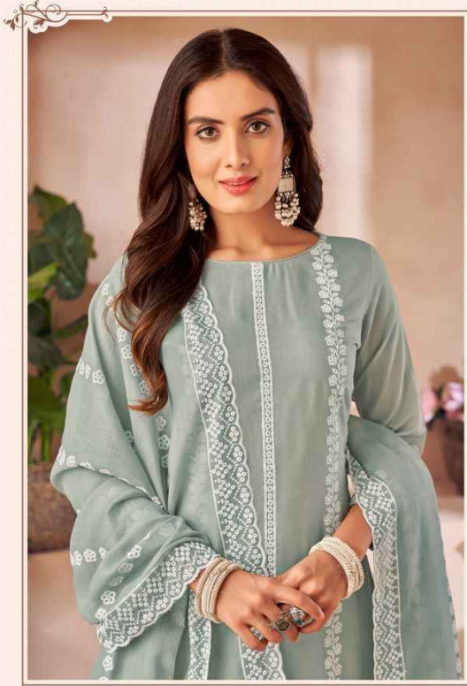
"Indian culture, quality fabrics, timeless elegance."