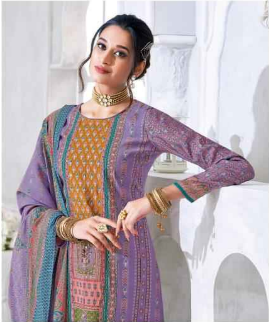
Model: 25/07/2023, 10:00 AM, 10:00 AM, 10:00 AM Model: 25/07/2023, 10:00 AM, 10:00 AM, 10:00 AM Model: 25/07/2023, 10:00 AM, 10:00 AM, 10:00 AM