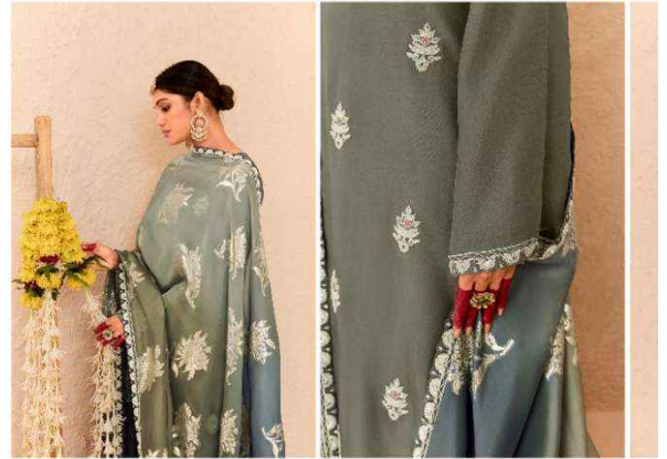
The dress was adorned with sparkling sequins that shimmered in the spotlight