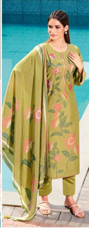
•3002• ■■■■ AARZOO