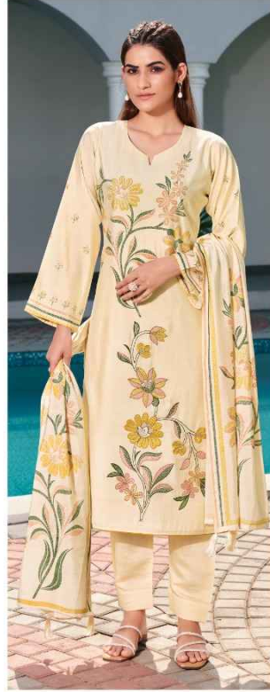
•3003• ■■■■ AARZOO