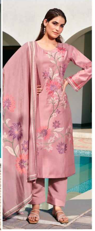
•3004• ■■■■ AARZOO