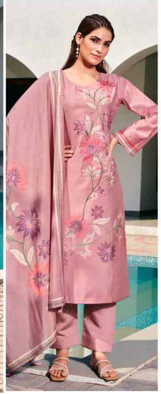
•3004• ■■■■ AARZOO