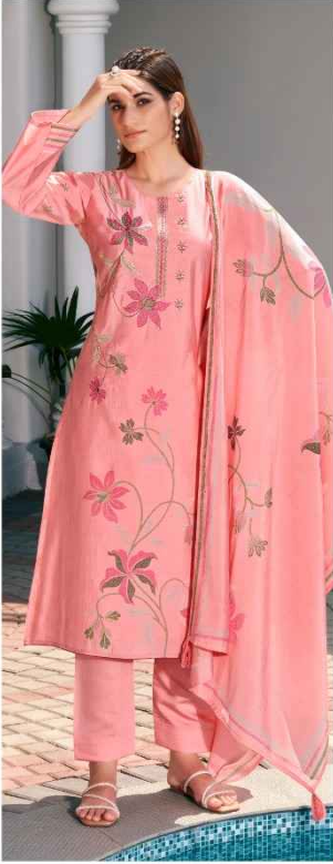
•3001• ■■■■ AARZOO