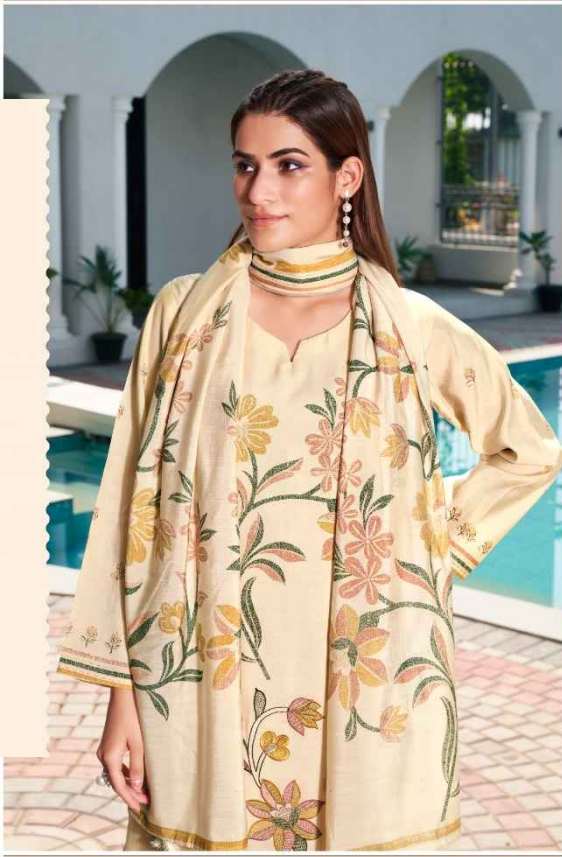
AARZOO • 3003 •

Stop by for a look at your comfortable design and delicate embellishments.