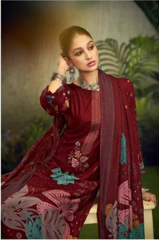
A MAJESTIC CHARM Unveiled