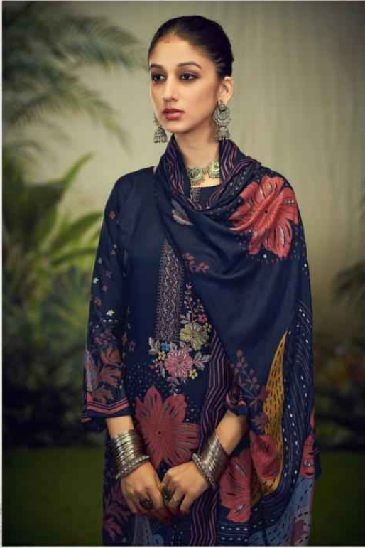
MAJESTIC BEAUTY Chander & Craft