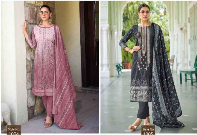
Style No. 1004