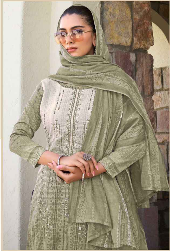
code # 1003