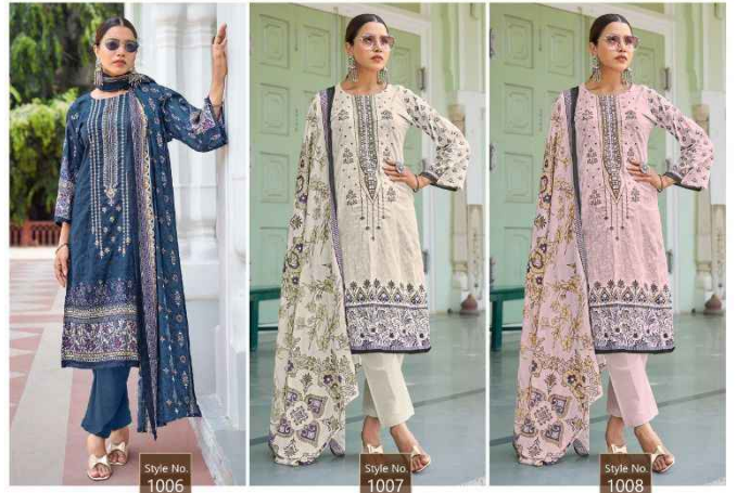
Style No. 1006