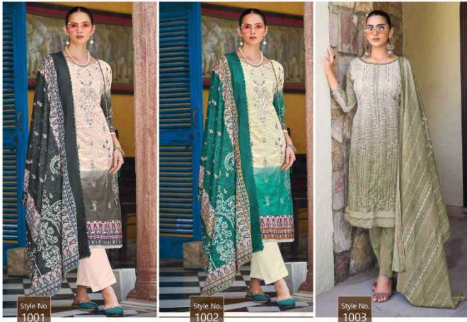
Style No. 1001