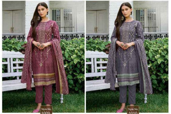
Style No. 1009