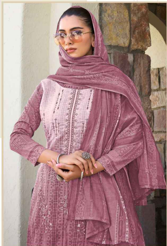
code # 1004