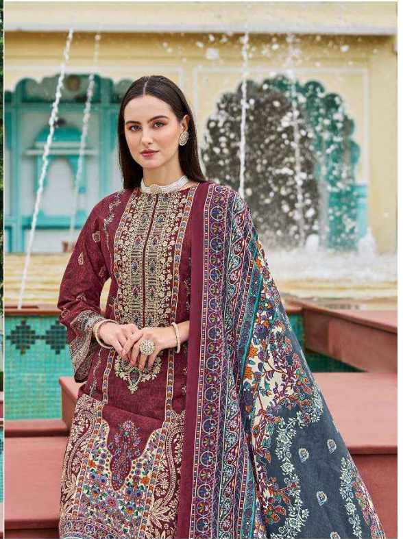
1003-002 "Fashion offers an alternate way of being, crossing and merging masculine and feminine."