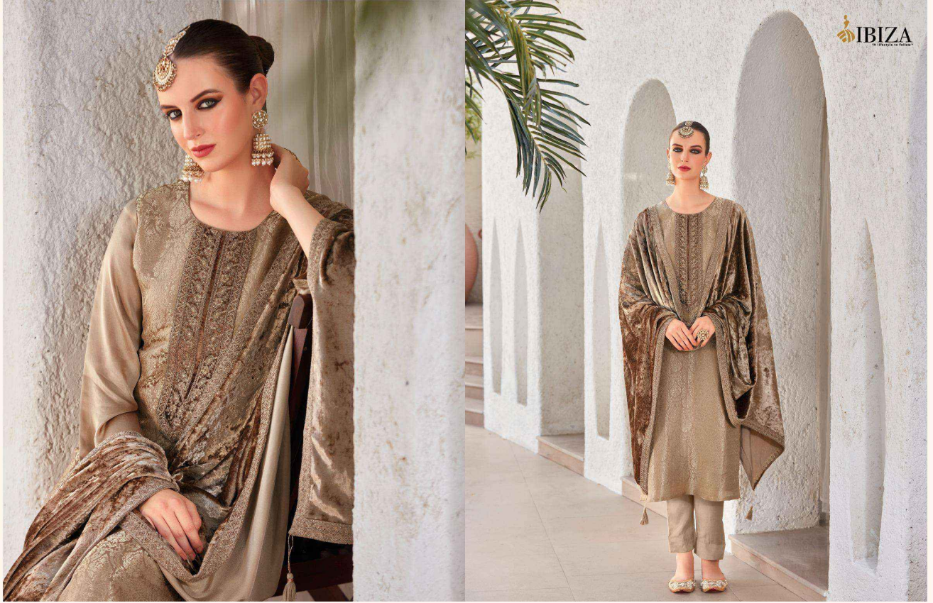
STYLISH ELEGANCE ● ● ● ●