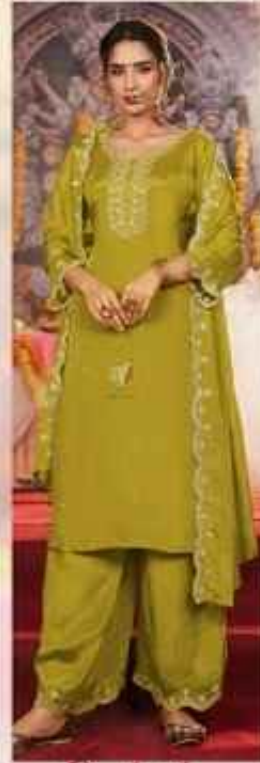
Sahiba VOL-00 4016