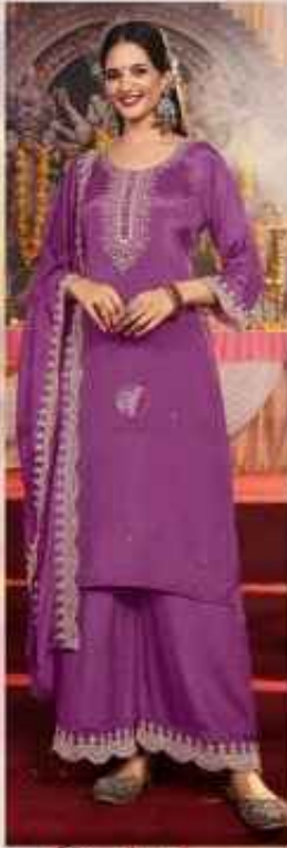
Sahiba VOL-00 4014