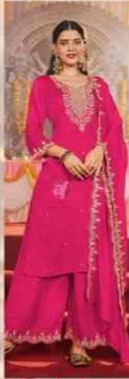
Sahiba VOL-00 4015