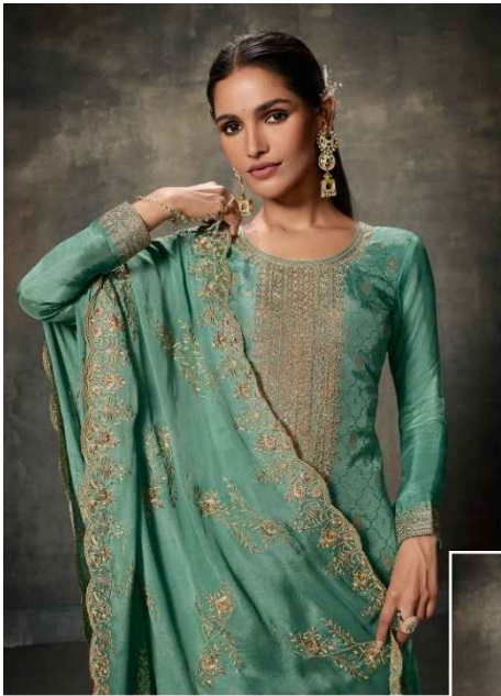
Embrace elegance and poise. D.NO. 14871