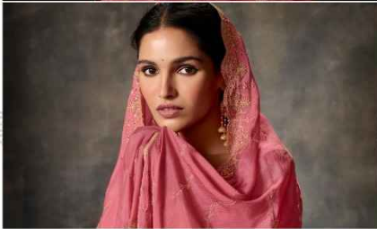
The art of being graceful D.NO.14872