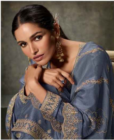
Brighten up your festive mood D.NO.14873