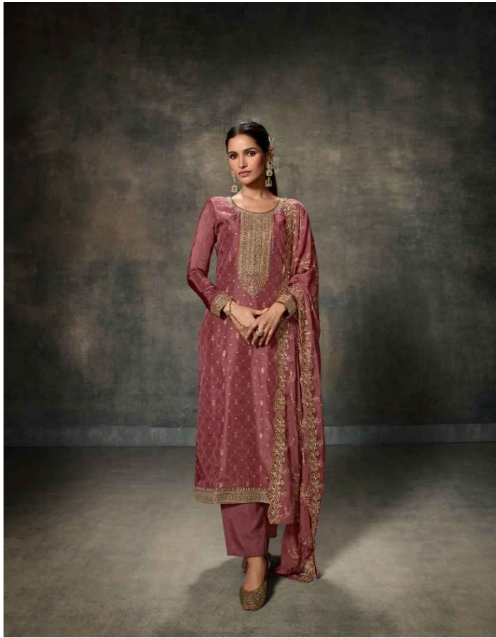
Set your own fashion goals D.NO. 14875