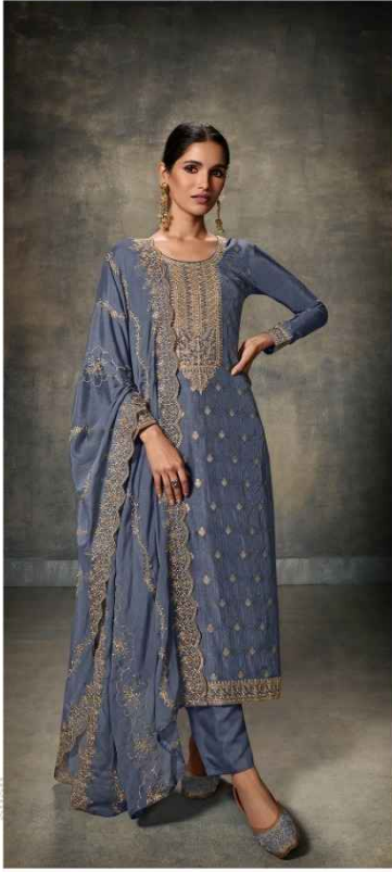
Brighten up your festive mood D.NO.14873