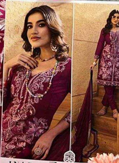
INARA ZAHIA TOP - Cambric Cotton With Heavy Embroidery Work 80