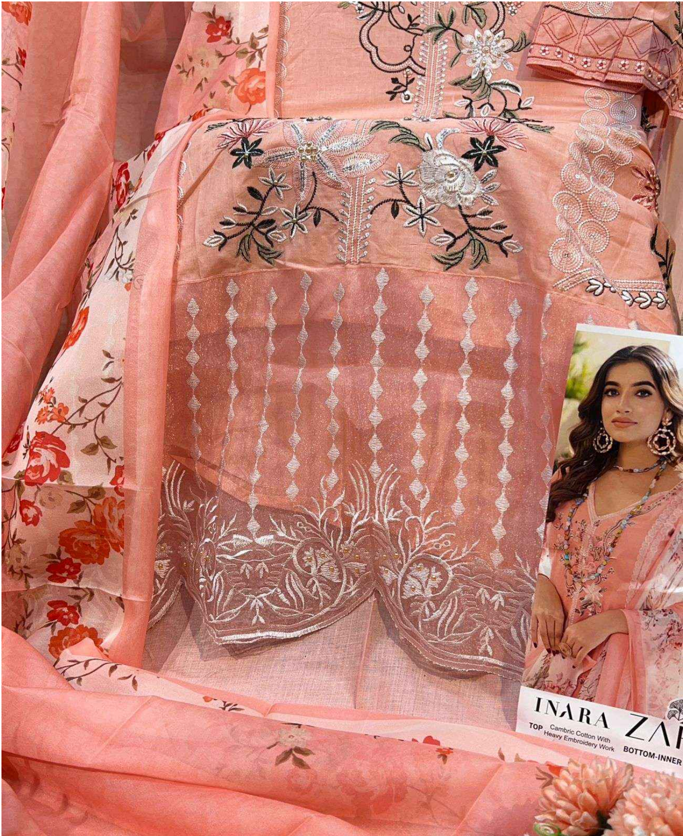
INARA ZAI TOP Cambric Cotton With Heavy Embroidery Work BOTTOM-INNER