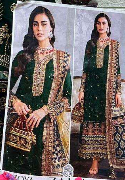
ROYA Zai D.No.10288 DUPATTA