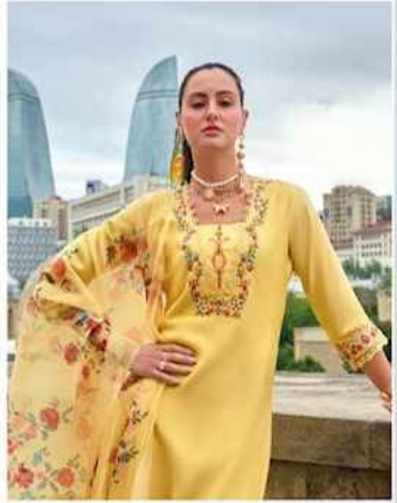
Mystic beauty Fashion is what you're offered, but style is what you choose.