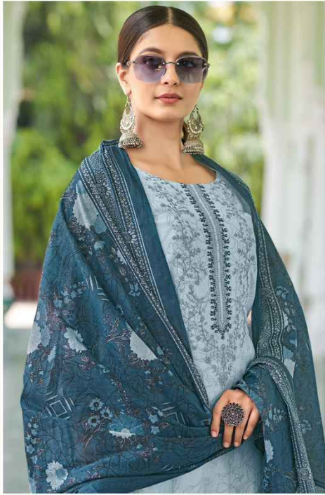
"Culture's Dance, Quality's Grace, Dresses that Beautifully Embrace."