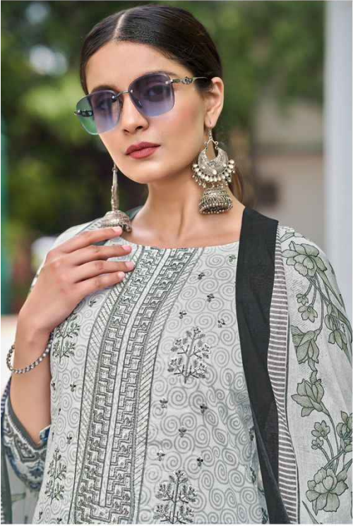
"Cultural Elegance, Quality's Bloom, Dresses that Exude Beauty's Perfume."