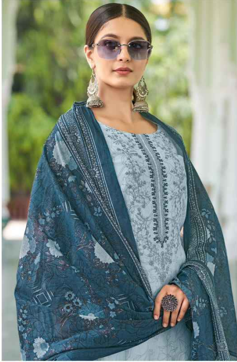
"Culture's Dance, Quality's Grace, Dresses that Beautifully Embrace."