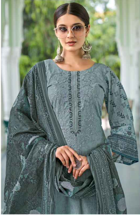
"Fabrics of Grace, Dresses that Embrace – Unveiling Your Radiant Culture."