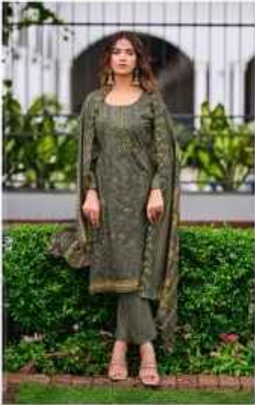
kurta (Shades of green, softness of floral prints) *41002*