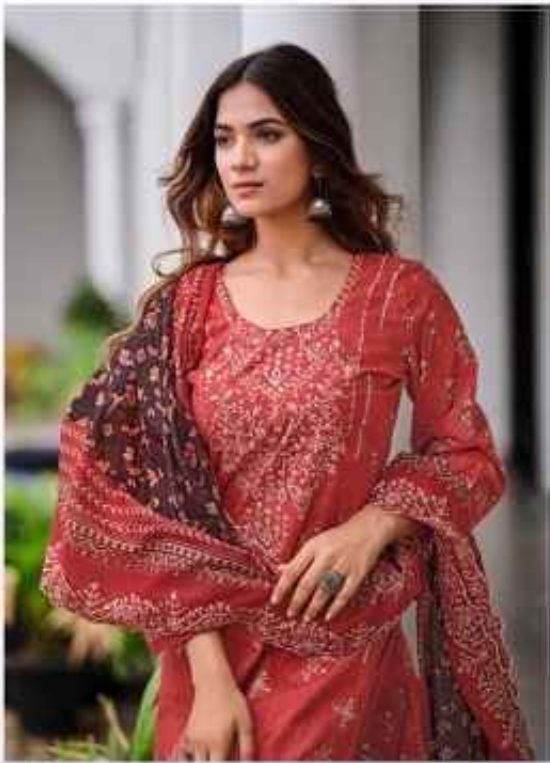
Design: (Trendy design, color of twill)