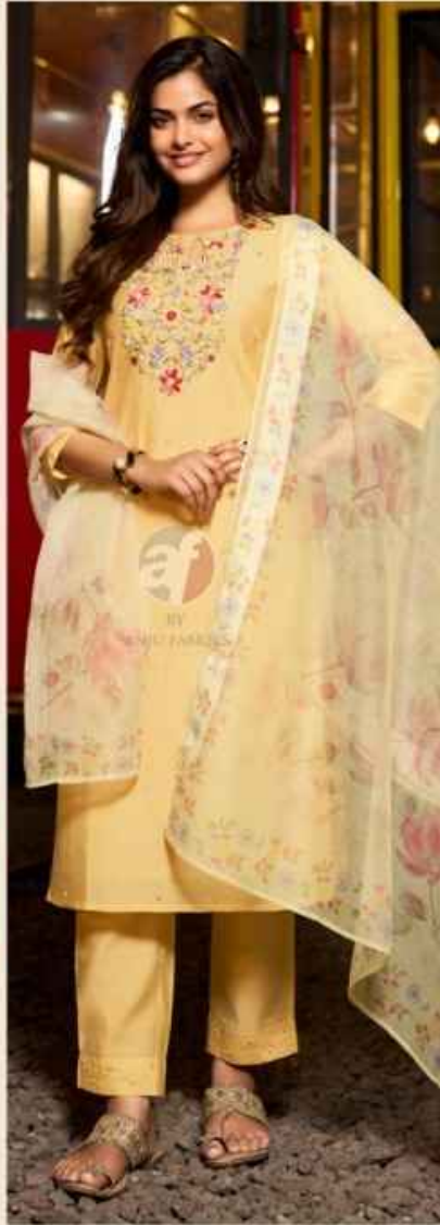
Chandani VOL-3 D.no.3732