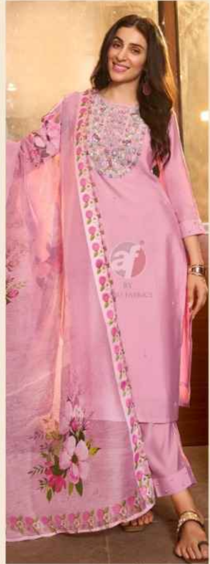
Chandani VOL-3 D.no.3733