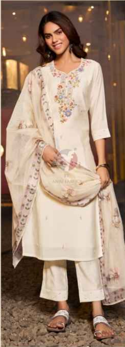
Chandani VOL.3 D.no.3734