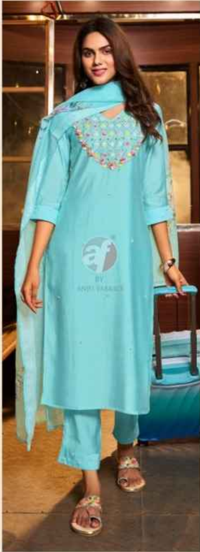
Chandani VOL-3 D.no.3731