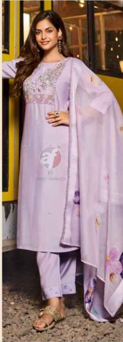
Chandani VOL.3 D.no.3735