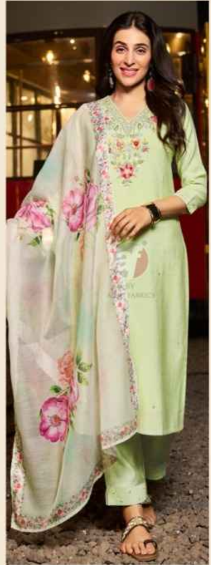
Chandani VOL.3 D.no.3736