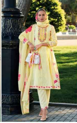
✧ 42712 ✧