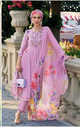
✧ 42714 ✧