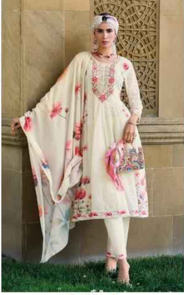
✧ 42711 ✧