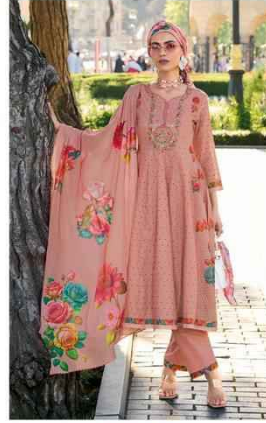
✧ 42715 ✧