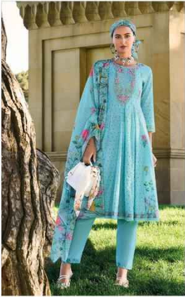
✧ 42713 ✧