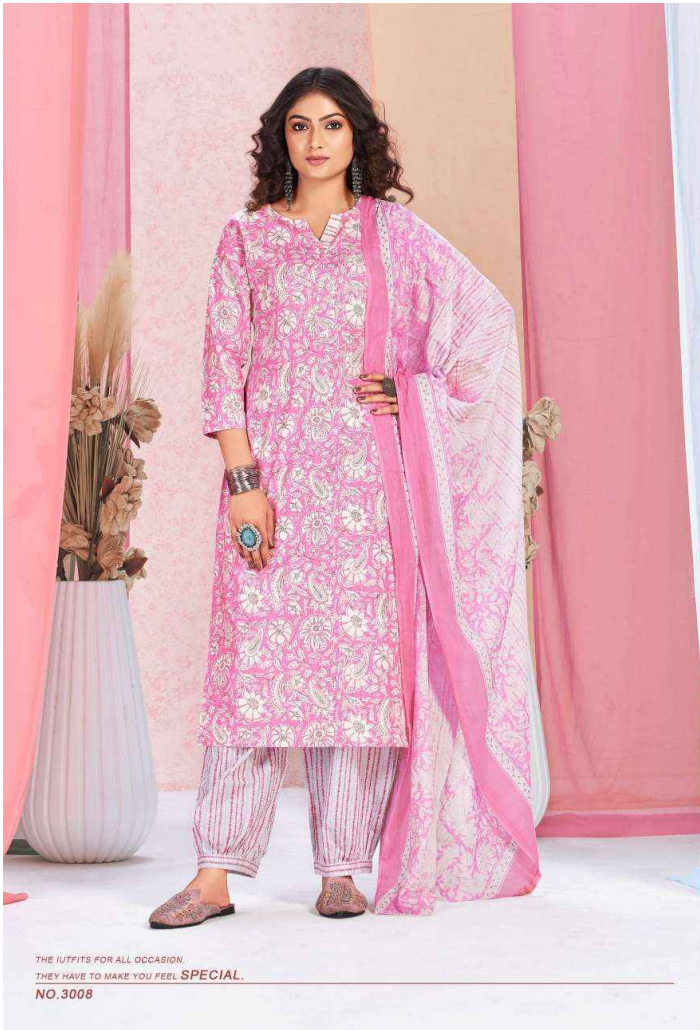
THE IUTFITS FOR ALL OCCASION THEY HAVE TO MAKE YOU FEEL SPECIAL . NO. 3008