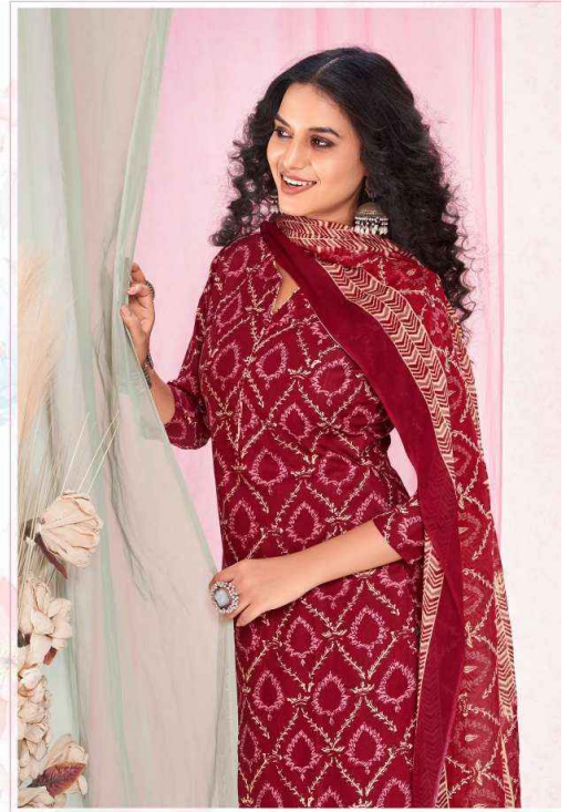
BE BEAUTIFUL WITH THIS MAGNETIC LOOK DESIGN AND MONOTONE COORDINATION. NO. 3006