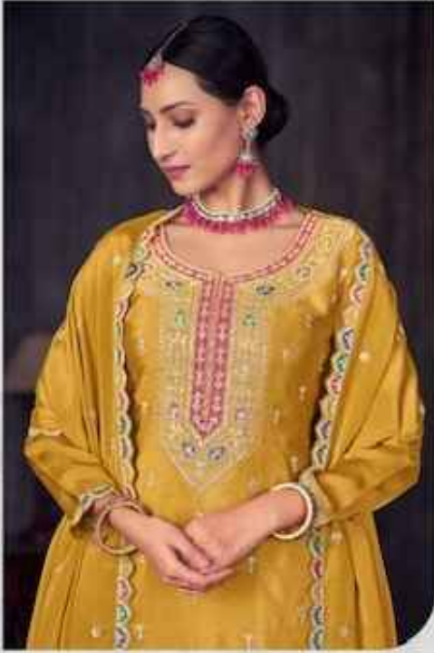
The flow of white silk over the entire garment, together with the subtle shades of the print