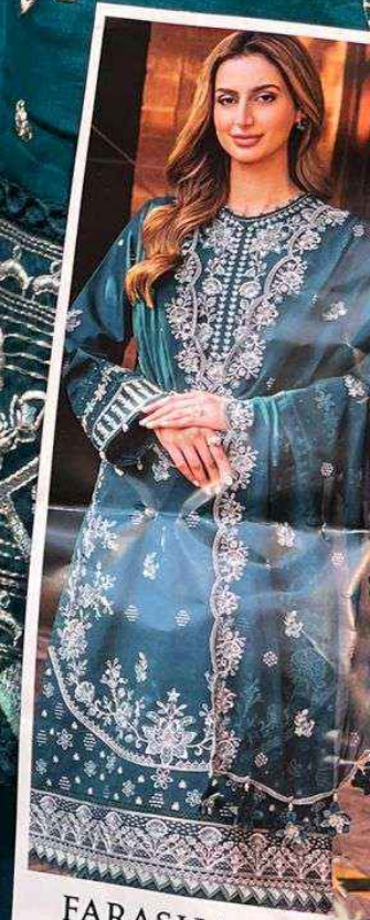
FARASHA VOL-2 TOP Cambrie Cotton With Heavy Embroidery Work