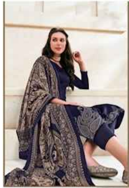
1006 Classic style with femininity with heavy print highlighted by contrast and textures