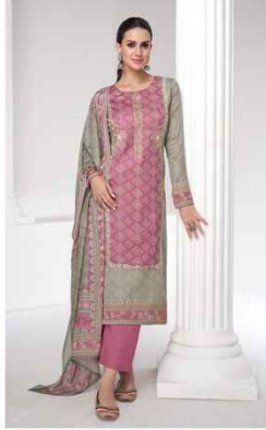
SUMMER PRIME -18002-