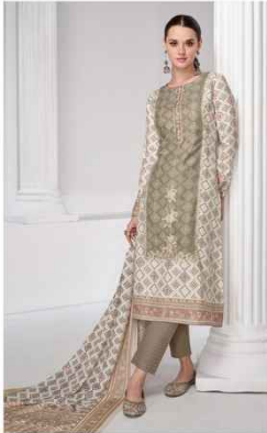
SUMMER PRIME -18003-