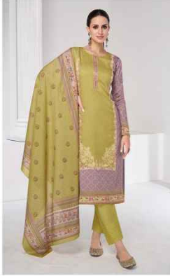
SUMMER PRIME -18001-