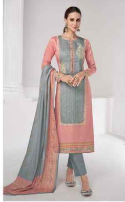
SUMMER PRIME -18005-