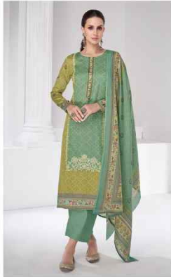
SUMMER PRIME -18004-