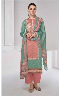
SUMMER PRIME -18007-

ممتاز آرٹس MUMTAZ ARTS® Purveyors of Elegance Summer PRIME