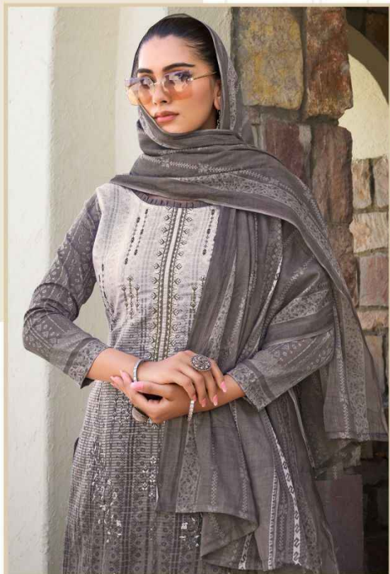
Code # 1009