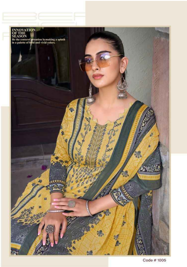
Code # 1005