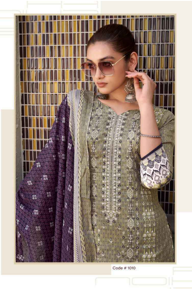
Code # 1010