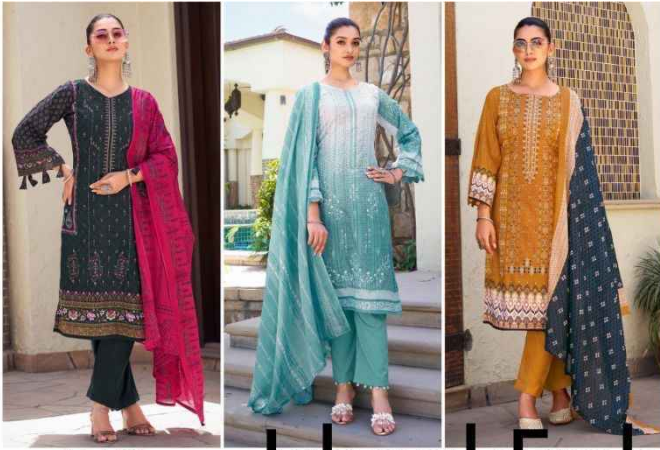
Code # 1001