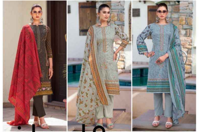
Code # 1007