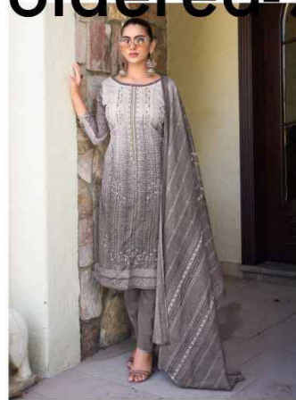
Code # 1009