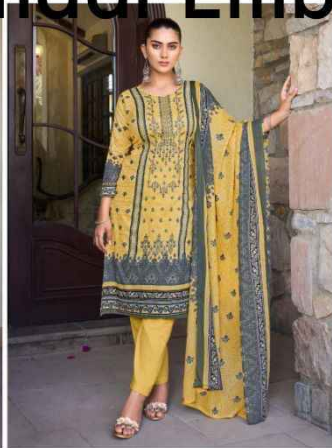
Code # 1005