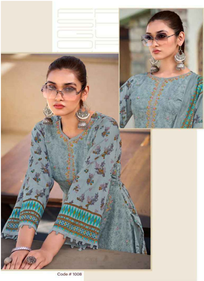
Code # 1008