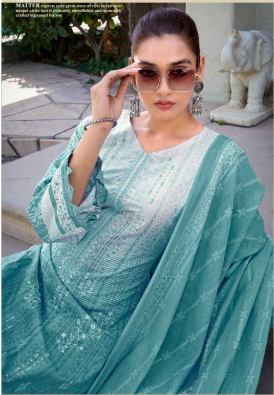
Code # 1002

LOOK THAT MATTER express your great sense of style in the most unique attire that is delicately embellished and expertly crafted expressed for you