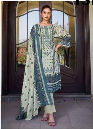
Code # 1004