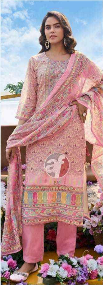
Pretty Petals VOL-2 D.no.3764