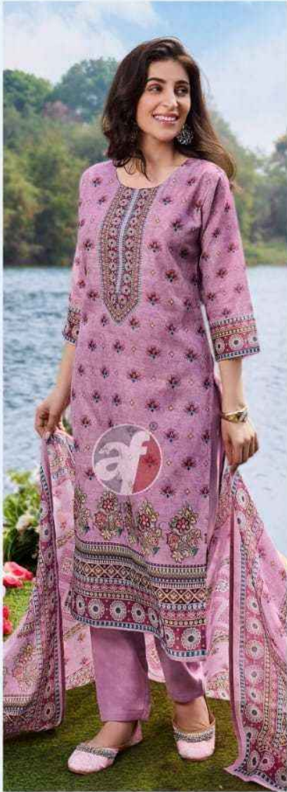
Pretty Petals VOL-2 D.no.3761