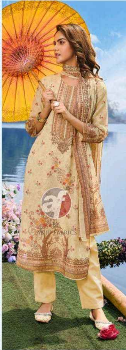
Pretty Petals VOL-2 D.no.3765