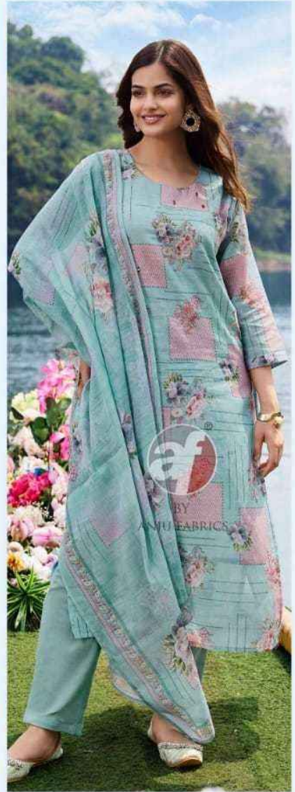
Pretty Petals VOL-2 D.no.3766