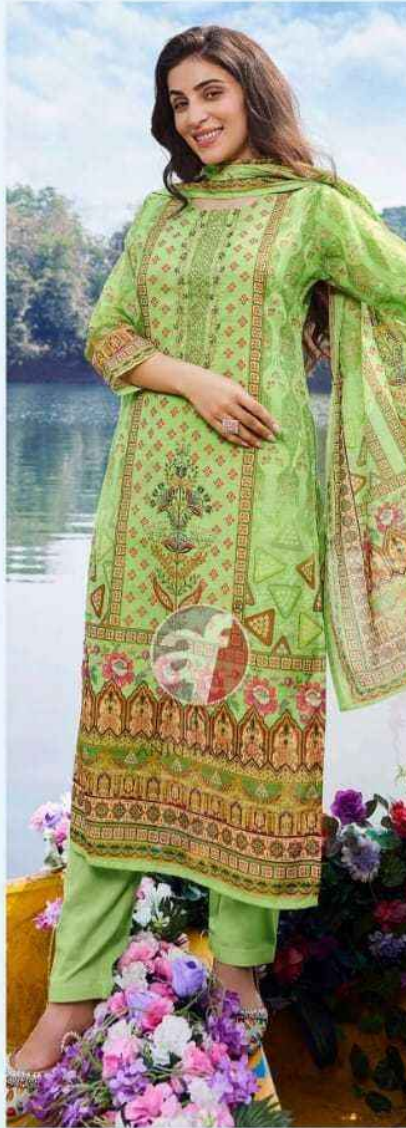
Pretty Petals VOL-2 D.no.3762