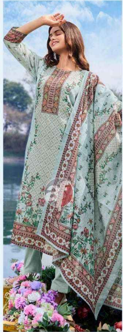
Pretty Petals VOL-2 D.no.3763