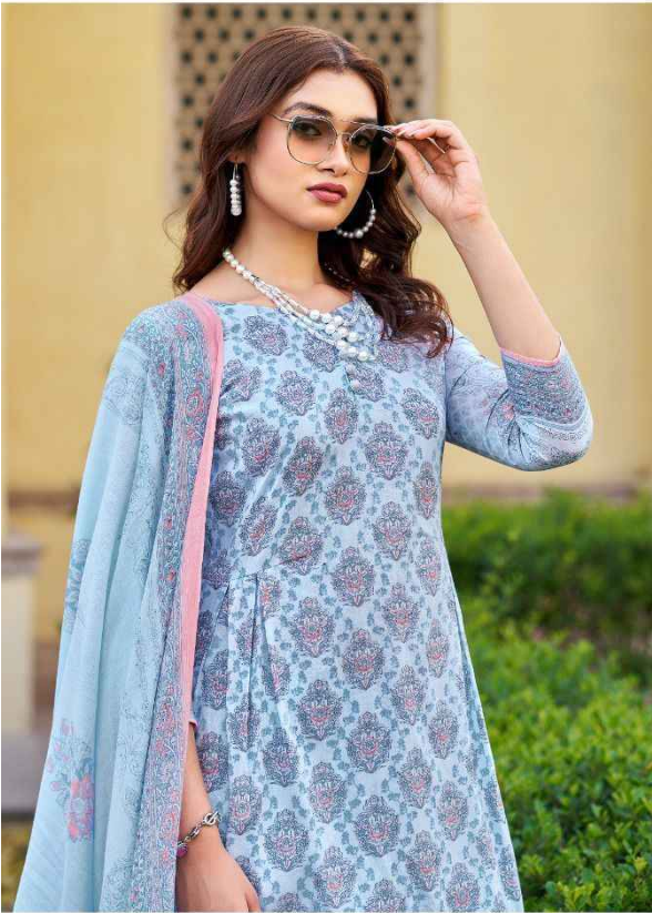
Just as wine ages with care, dresses need meticulous crafting and premium fabrics to express their excellence.