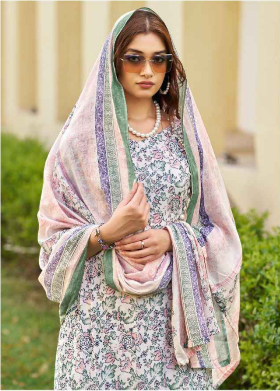
"Where Confidence Meets Glamour, You're Always Gorgeous."