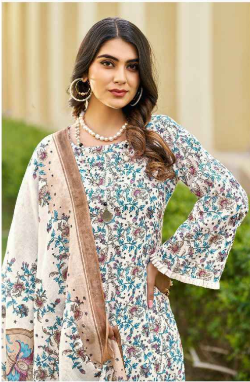
Dresses, resembling wine, require expert craftsmanship and the use of the finest fabrics to reveal their quality.