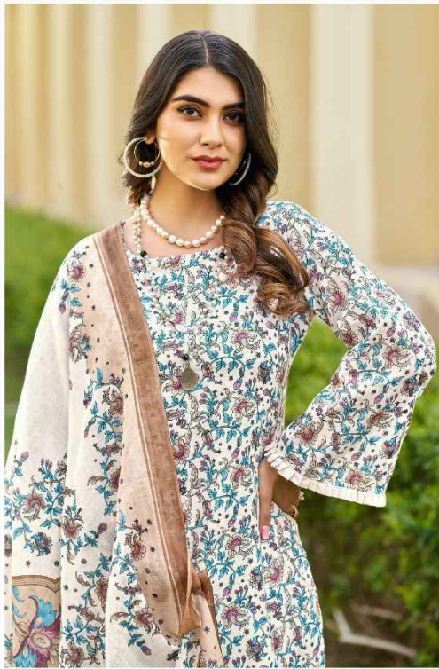
Dresses, resembling wine, require expert craftsmanship and the use of the finest fabrics to reveal their quality.