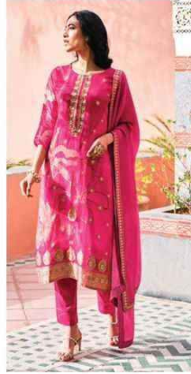
NS - 03