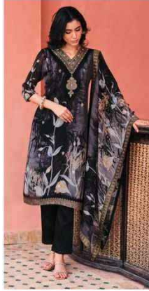
NS - 02