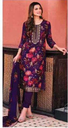
NS - 04