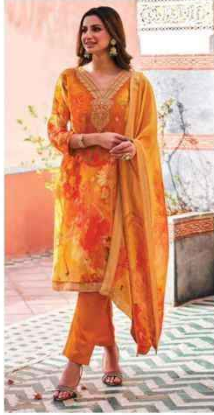
NS - 01