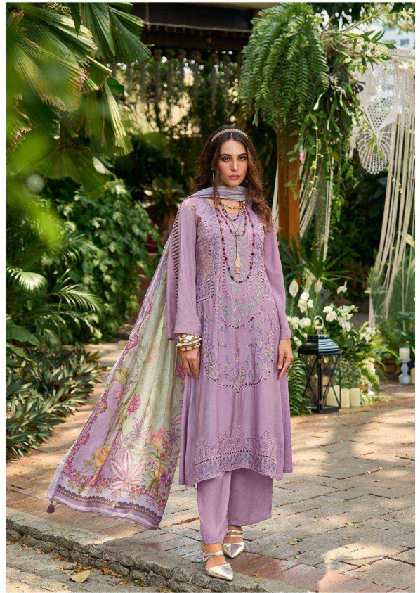
Neishi : 1005