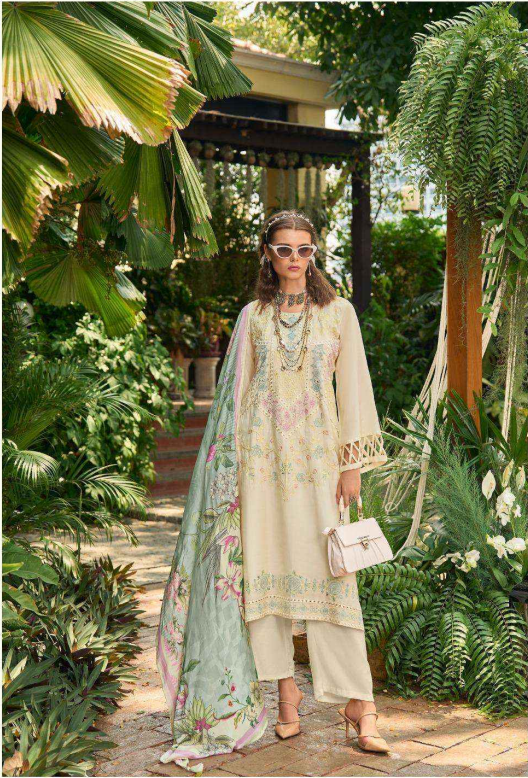
Neishi : 1004