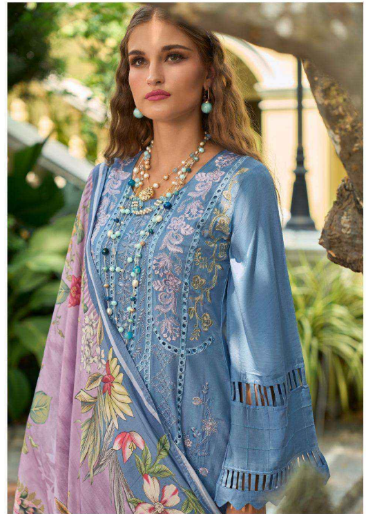
Neishi : 1003