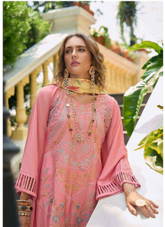
Neishi : 1001