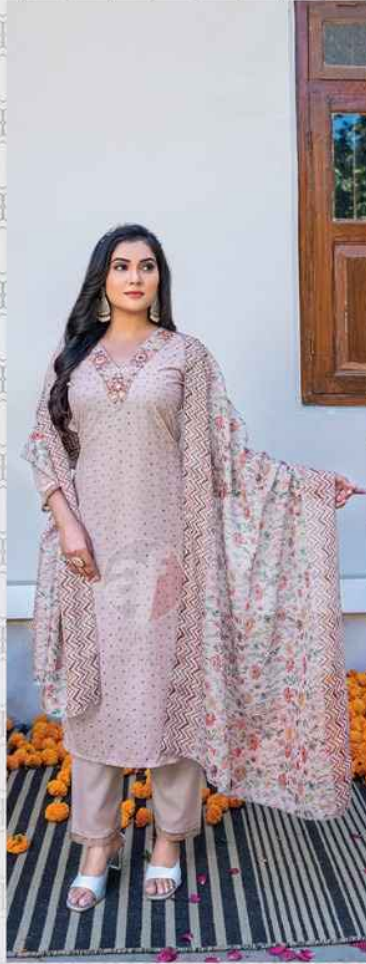
RICH 3675 Lady