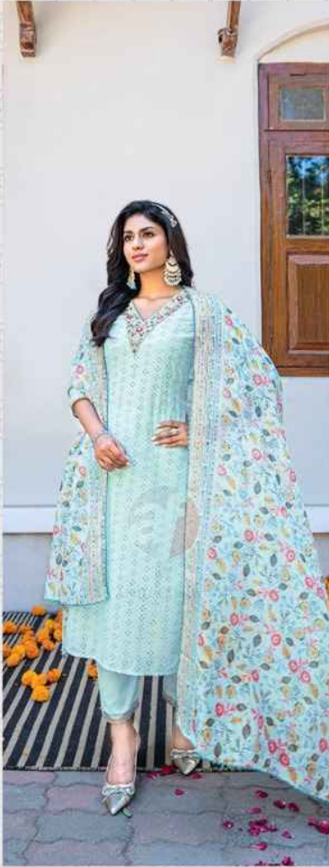
RICH 3674 Lady