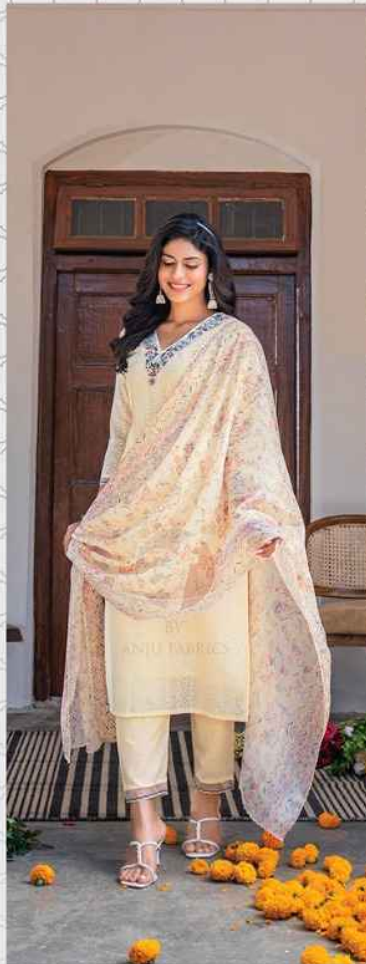
RICH 3672 Lady