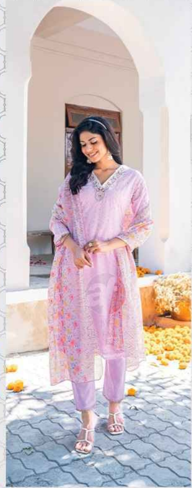
RICH 3676 Lady