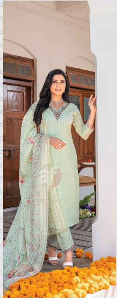
RICH 3673 Lady