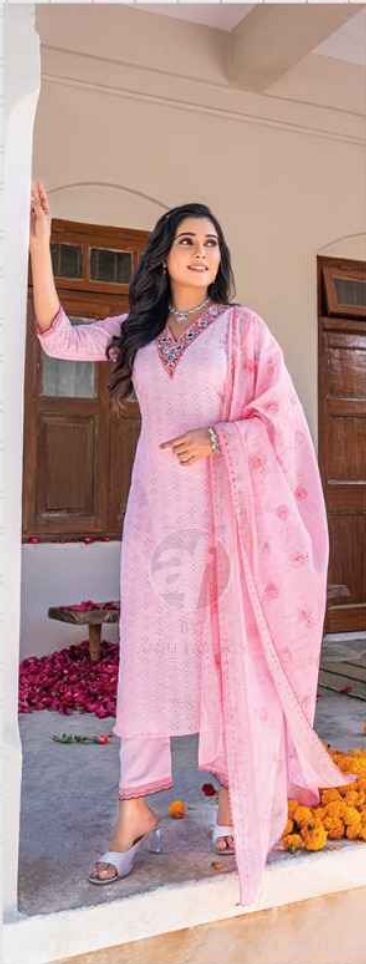
RICH 3671 Lady