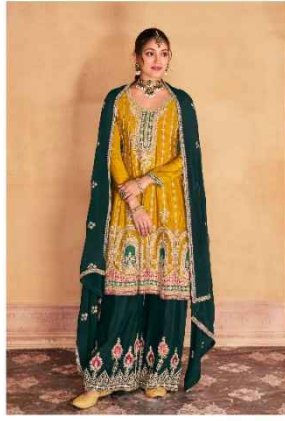
CODE | 2052