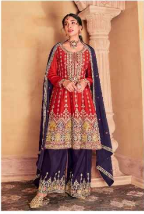
CODE | 2051