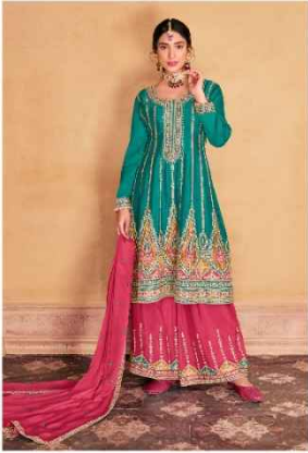
CODE | 2053