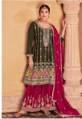
CODE | 2054