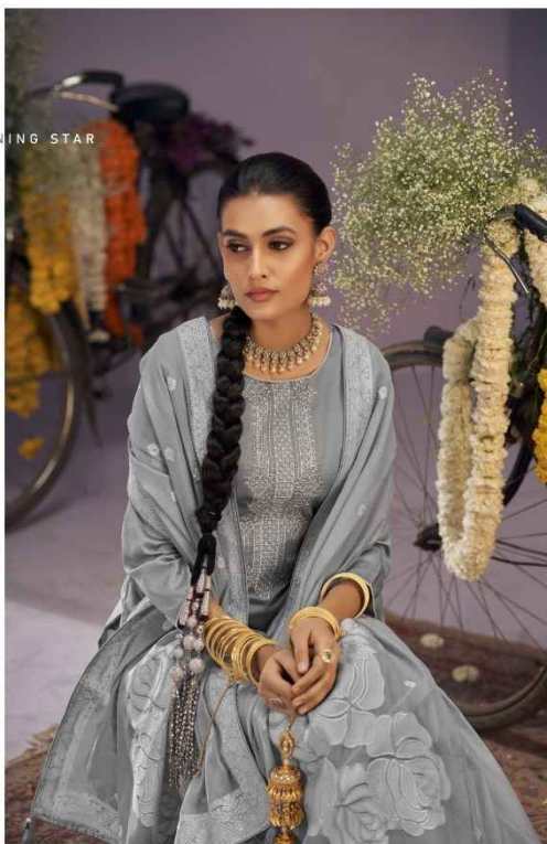
Her sari, the shining star, she shines first she shines brightest, and she shines longest