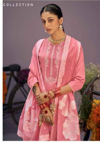
Embell yourself with an exquisite collection crafted with the finest materials and infused with divine grace.