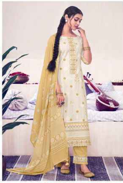
LOOK | 8981