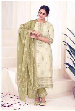
LOOK | 8984