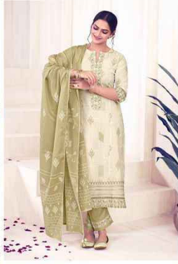
LOOK | 8984