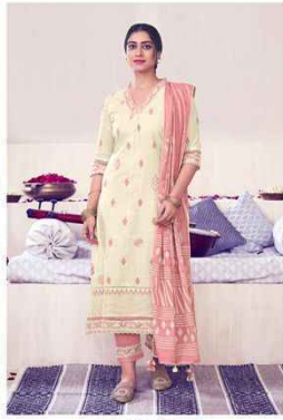
LOOK | 8982