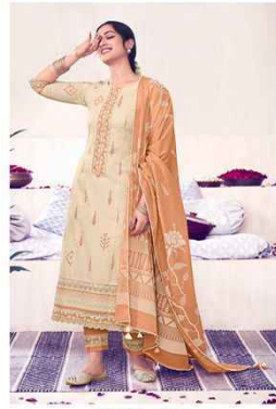
LOOK | 8985