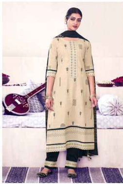
LOOK | 8983