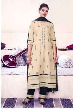
LOOK | 8983