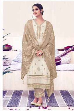
LOOK | 8986