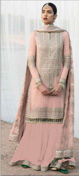
S - 98 A

TOP - FOX GEORGETTE EMBROIDERD WITH HAND WORK BOTTOM- HEAVY SANTOON WITH LACE WORK INNER - HEAVY SANTOON DUPATTA - NAZNEEN HEAVY EMBROIDERED WITH FOUR SIDE LACE WORK