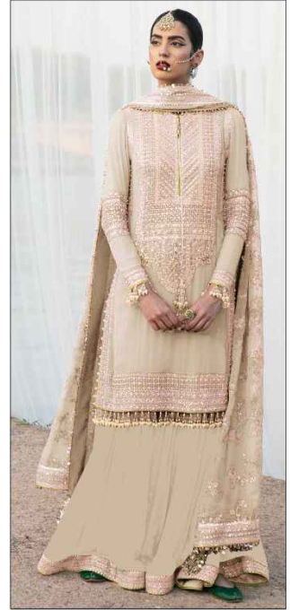
S - 98 D