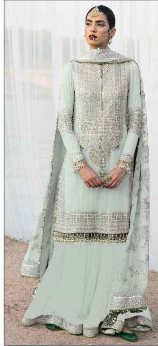
S - 98 B