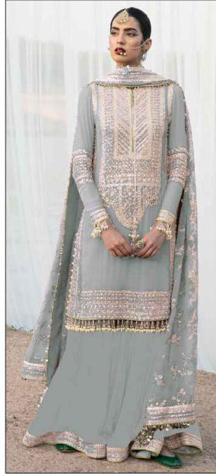
S - 98 C