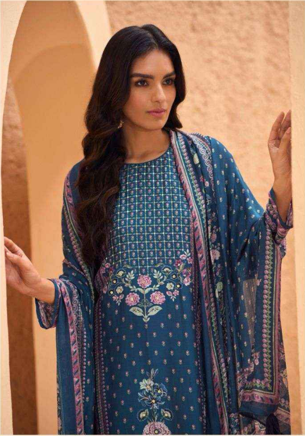
TREND FASHION / 2024