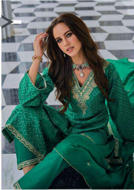
ALWAYS LOVE TO BE FASHIONABLE