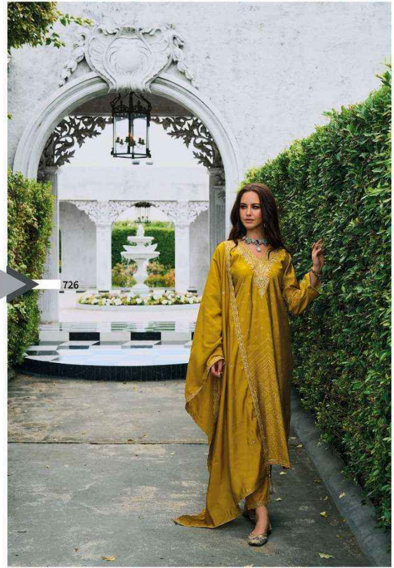
FASHION THAT EXISTS IN EVERYTHING