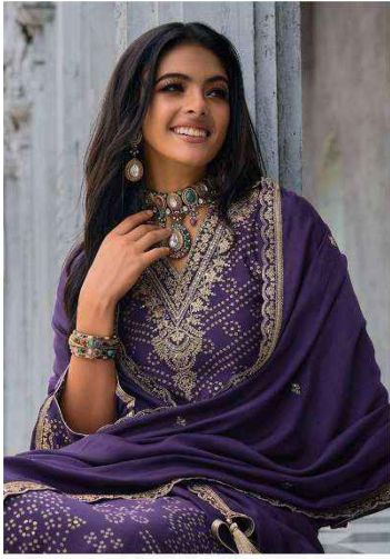
LIFE ISN'T PERFECT BUT YOUR OUTFIT CAN BE