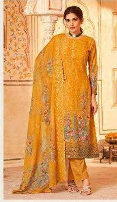
Code = 3002