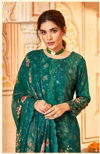
"Impress" | "Dussehra to Dussehra, Raat to Raat." Style #3006