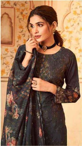
"Artistry" | Beyond Style, Exploring the Artistry of Fashion. Style - 3005