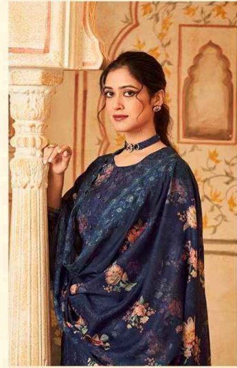
"Fashion" [Dive into the ocean of style with our curated selection of finest quality designs] Style - 3008