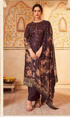
Code = 3004