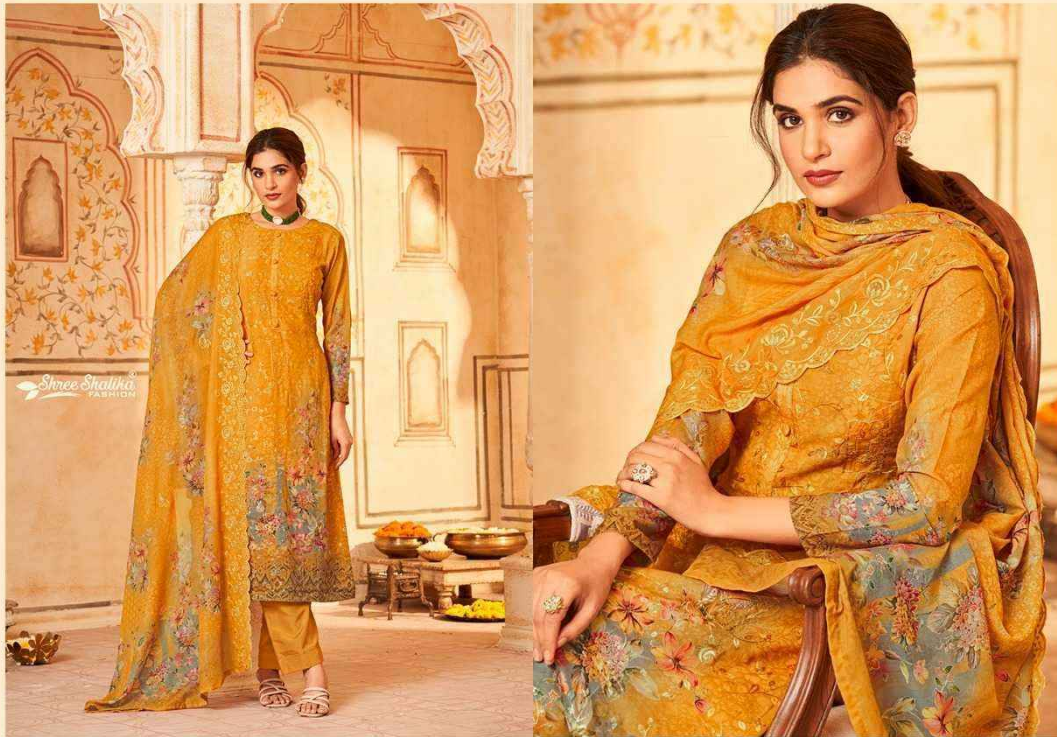
"Fashion" is the sense of style with our careful selection of every style design. Style : 3002