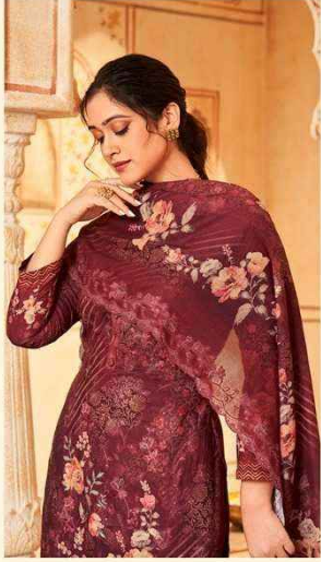
"Designs" Explore the beauty of cutting, edge, drapes and accessories with a new latest design. Style - 3007