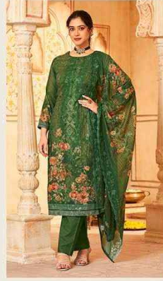
Code = 3003