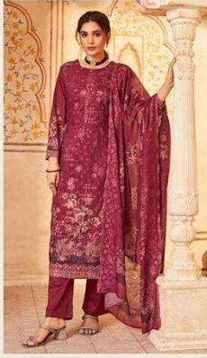
Code = 3001