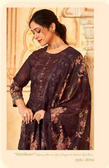
"Excellence" | Ready To Wear, Your Passport to Fashion Excellence | Style - 3004