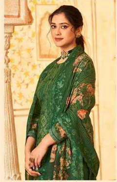
"culture fashion" Handing the Zirconium in Zirconium Style - 3003