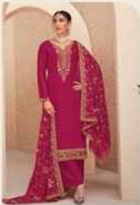
CODE I 1183