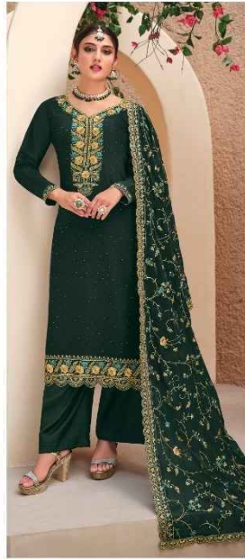
CODE | 1182