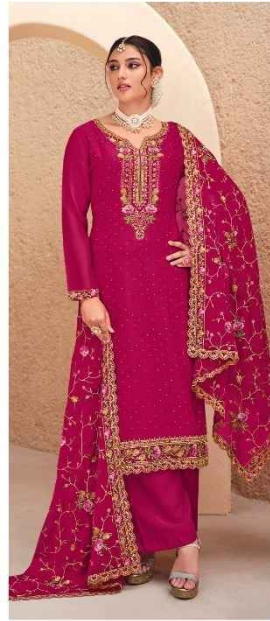
CODE | 1183