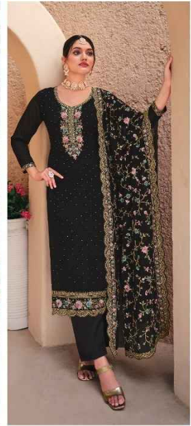
CODE | 1184