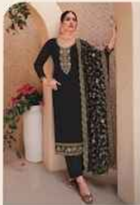
CODE I 1184