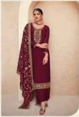
CODE I 1181