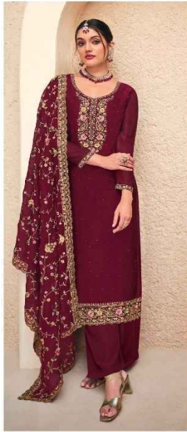
CODE | 1181