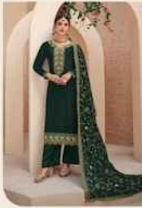
CODE I 1182