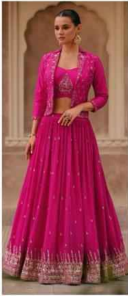
CODE - 5391