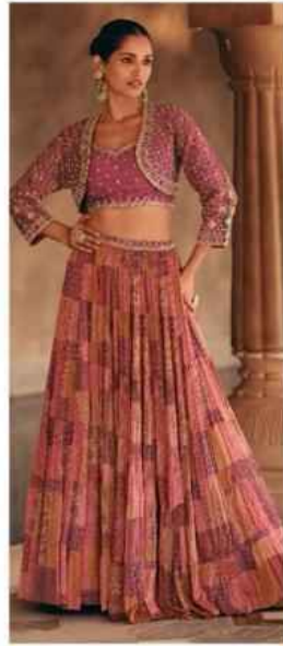
CODE - 5392