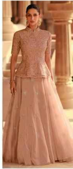
CODE - 5393